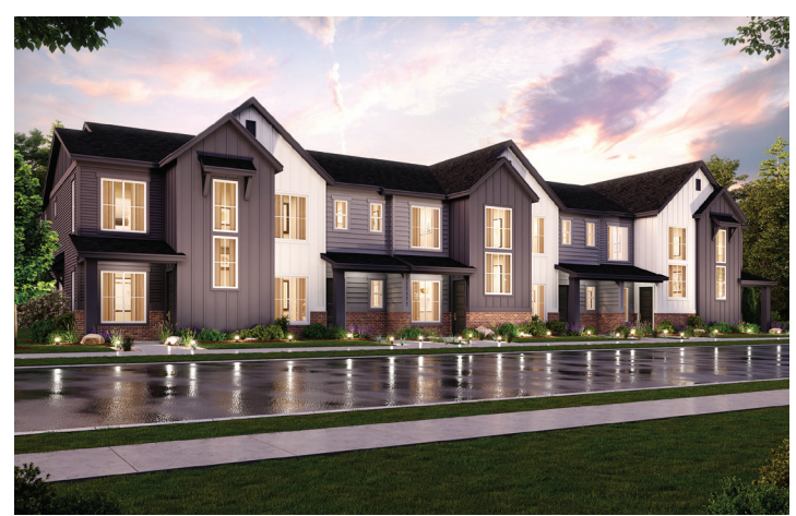
ELEVATION A - 6 PLEX