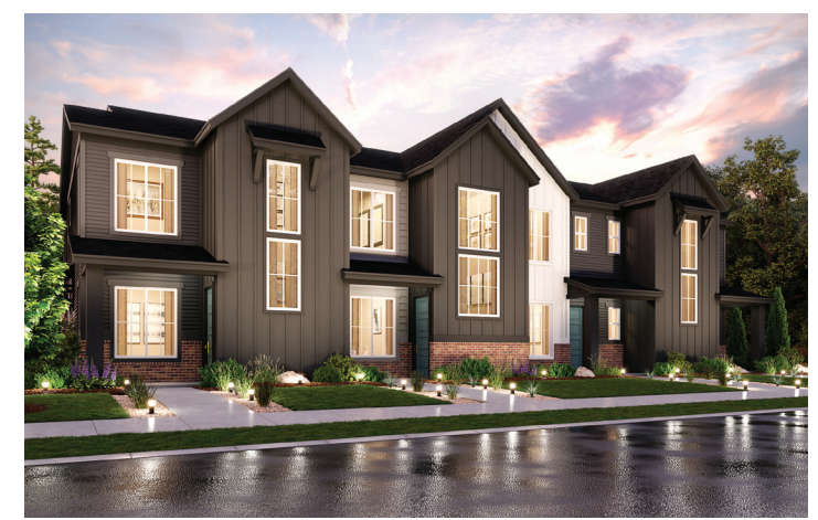
ELEVATION A - 4 PLEX

APPROX. 1,368 SQ. FT. | 2-STORY | 3 BEDROOMS | 2.5 BATHROOMS | 2-BAY GARAGE