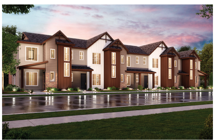
ELEVATION B - 6 PLEX