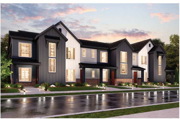
ELEVATION A - 5 PLEX