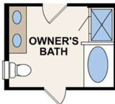
OPT. OWNER'S BATH TUB & SHOWER