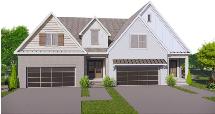
Windsor C | Tudor D

2,368 - 2,476 Sq.Ft. | 3 Bed | 3 Bath | 2-Bay Garage +Bonus Room