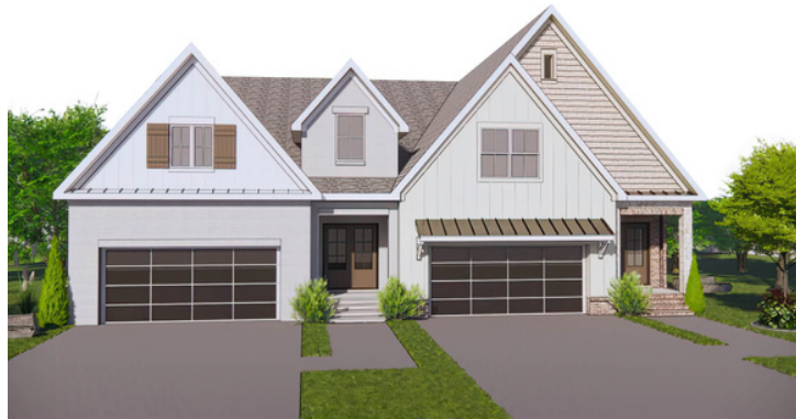
Windsor G | Tudor H