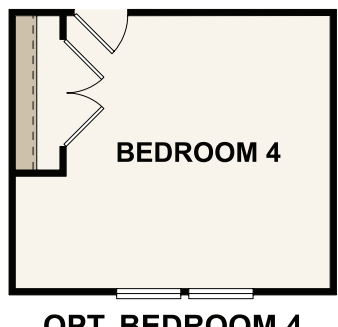
OPT. BEDROOM 4